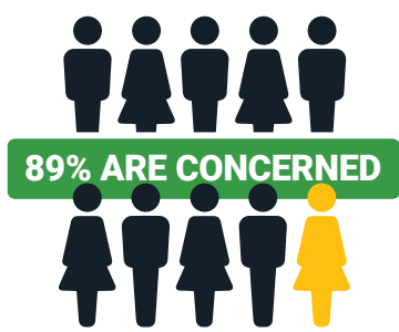
89% of Canadians are concerned about people using information available about them online to attempt to steal their identity. 2

but not all cybercrime is identity theft.