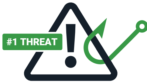
Phishing campaigns are the No. 1 threat to consumer cyber safety. 1